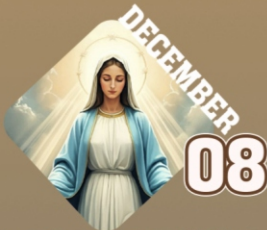
The Immaculate Conception of the Blessed Virgin Mary