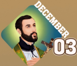
Saint Francis Xavier