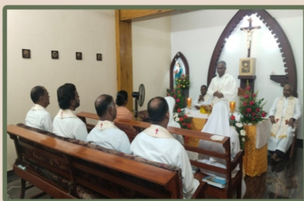
Bishop's Feast Day Mass