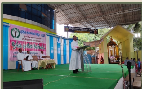
Elders' day celebration of Mulagumoodu Vicariate