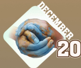
International Human Solidarity Day