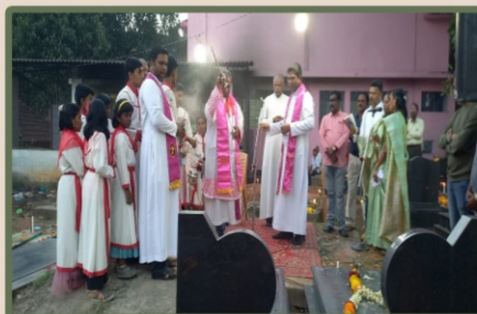
All Souls Day Celebration