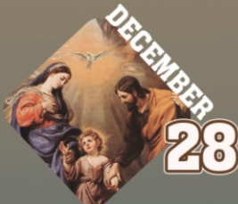
Feast of the Holy Family