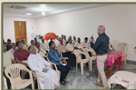
Ongoing Formation for Priests