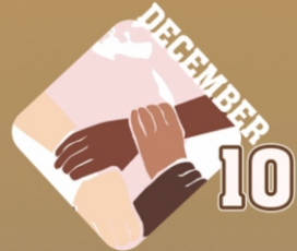
Human Rights Day