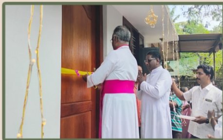
Jubilee House Blessing at Palavilai