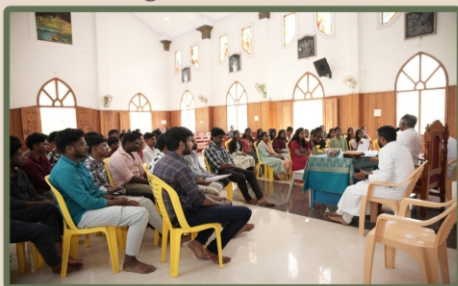
Siluvaipuram Pastoral Visit