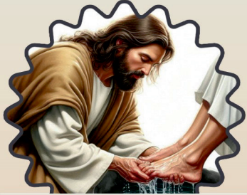
April 02 - Maundy Thursday