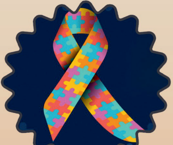
April 02 - World Autism Awareness Day