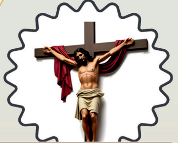
April 03 - Good Friday