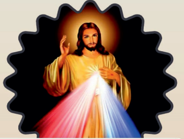
April 12 - Divine Mercy Sunday