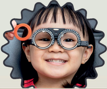
April 01 - Prevention of Blindness Week