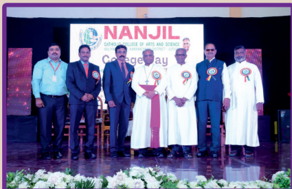
College Day, Nanjil Catholic College of Arts and Science, Kaliakkavilai