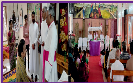
Pastoral Visit, Palliyadi