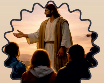
April 26 - Vocation Sunday

Bishop's House, P.Box 1 UNNAMALAIKADAI 629 179 KANNIYAKUMARI DT., TAMIL NADU INDIA