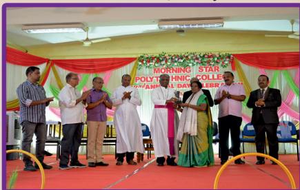
College Day, Morning Star Polytechnic College, Chunkankadai