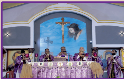
Mass at Kurusumalai, Vellarada