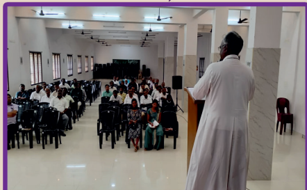
Diocesan Pastoral Council